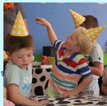
Old Mac's Classroom/ Party Room