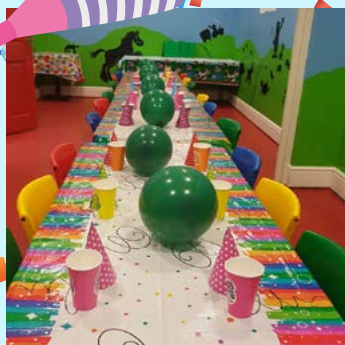
Soft Play Party Rooms